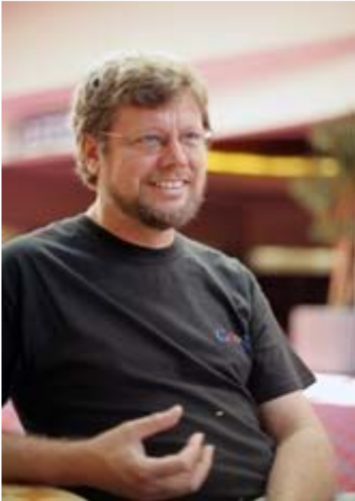
Guido Van Rossum